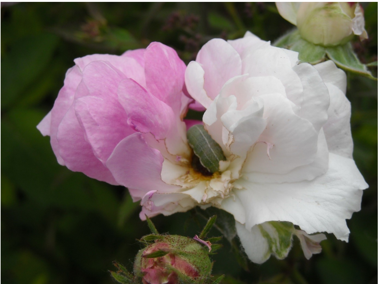
Photographs of roses that blossomed on dead rose bush after returning from Turzovka.